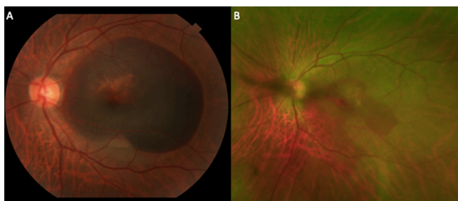
Figure 1 Fundus photography left eye (OS) of a patient at presentation (A) demonstrating dense submacular haemorrhage with foveal distortion and central pigment epithelial detachment (PED). Magnified widefield image (B) 3 weeks post-operative demonstrating resolution of dense submacular haemorrhage and restoration of foveal contour, with mild remaining flat haemorrhage.

Overall, 22/36 patients (61.1%) experienced visual improvement post-operatively, with 15/36 patients (41.7%) gaining 3+ lines and seven patients (18.9%) gaining 1–2 lines of improvement. Five patients experienced worsening of vision. Median VA showed statistical improvement at month 3 for patients with PCV ( p = 0.043 ) and with traumatic CNV or macroaneurysm ( p = 0.046 ), while showing a non-significant trend to improvement in wet AMD ( p = 0.10 ) and undifferentiated CNV ( p = 0.068 ). Mean and median length of follow-up were 19.2 months and 12 months, respectively, with a range of 1–63 months. Overall, 36/37 patients were seen at 3-month follow-up. Two patients with LP vision at 3-month interval were excluded from analysis. One patient was lost to follow-up after the 1-month interval and was analysed at 3-month interval using last observation carried forward.